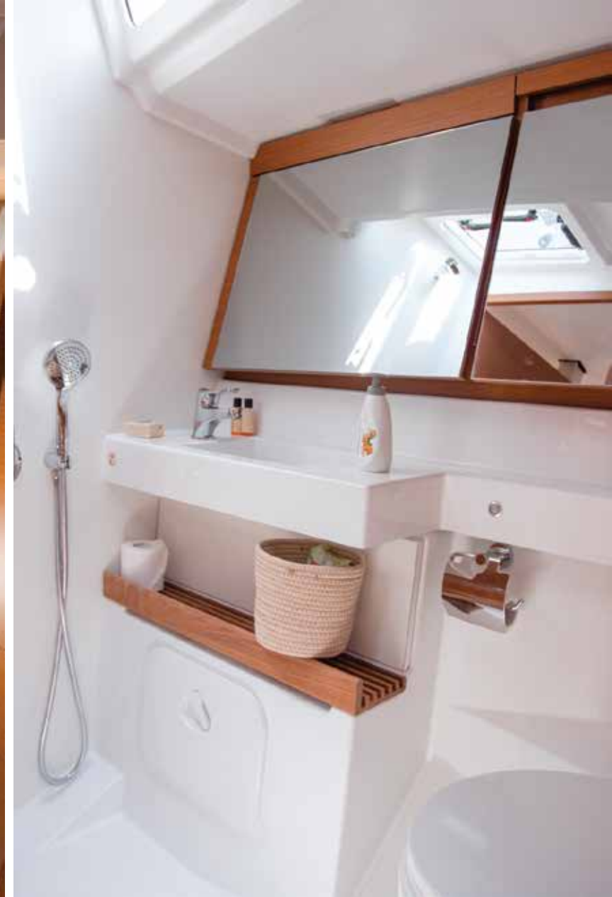
Two large aft double cabins with head/shower