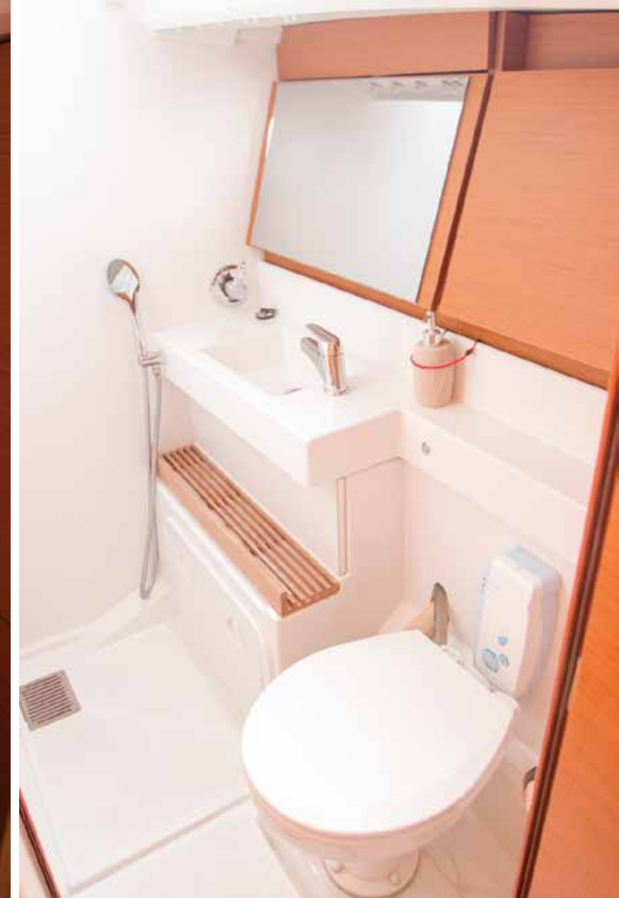
The two forward cabins can be combined to create one extra large double master cabin with its own head (wc/shower)