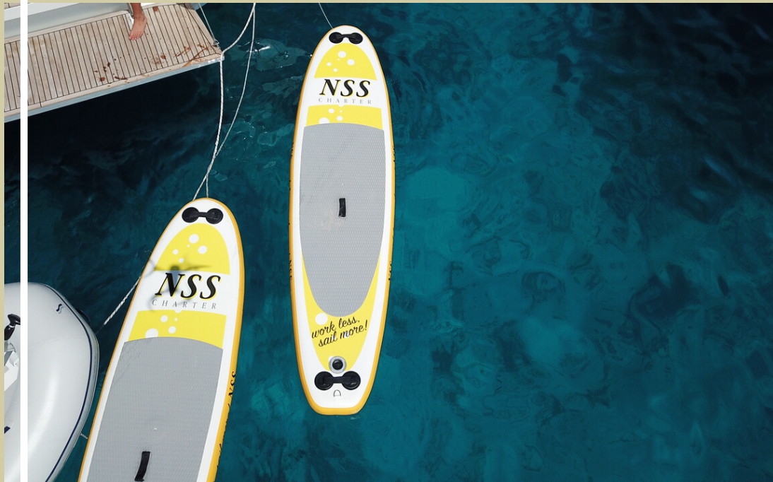
STAND UP PADDLE